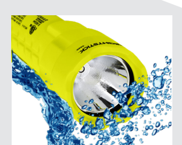
Durable polymer body is impact & chemical resistant